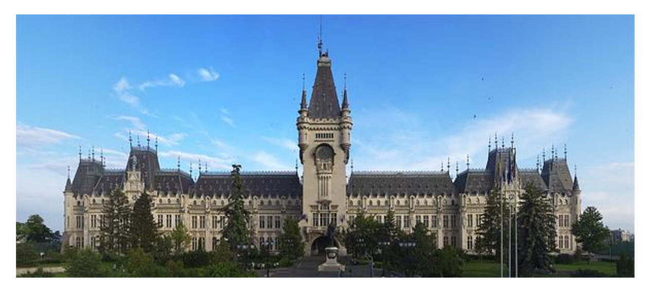
The Palace of Culture – "Moldova" National Museum Complex